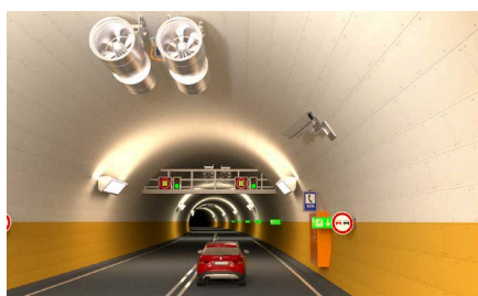
e.g. road tunnel

Art. No. 501430 FAZ II 10/10 C → Art. No. 501430 FAZ II 10/10 HCR