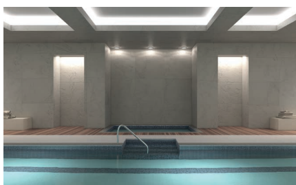
e.g. indoor swimming pools

Tougher than the conditions of corrosion resistance class III, these stainless steels may be used, also if other particular aggressive conditions exist (e.g. permanent, alternating immersion in seawater or chloride atmosphere in indoor swimming pools, or atmosphere with extreme chemical pollution).